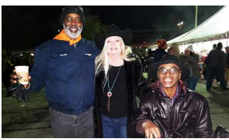
SAILS CEO and Board Members enjoy networking at the San Antonio Rodeo Cowboy breakfast