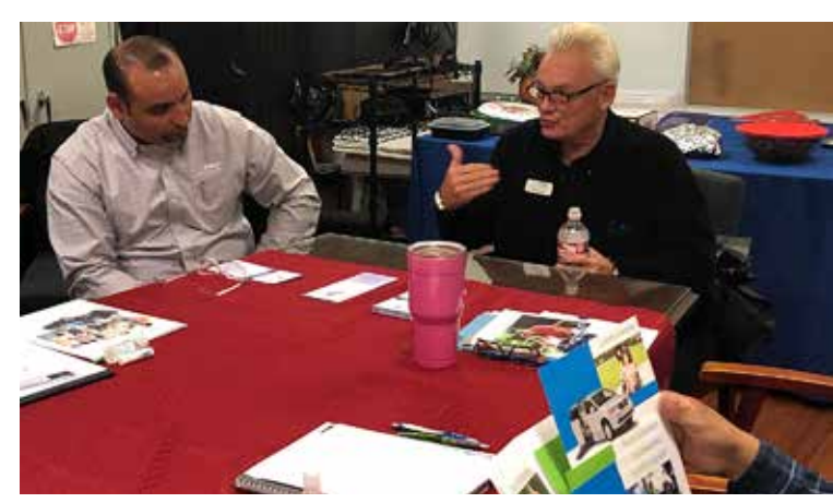
Presentation at SAILS from MobilityWorks