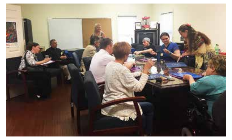
Guests from Ukraine has questions answered about independent living programs that SAILS has been providing to local cummunities since 1981.

Online Request For Services, SAILS Consumers: http://sailstx.org Click link tab "Contact", and then "Request For Services"