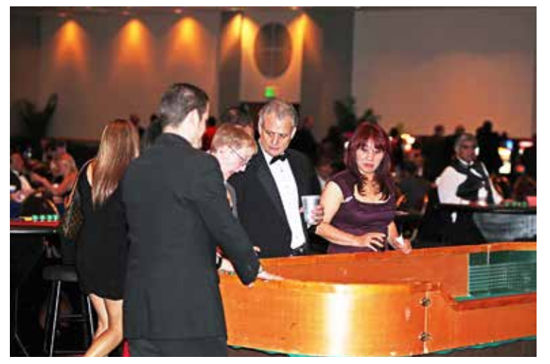
Guests at Roulette