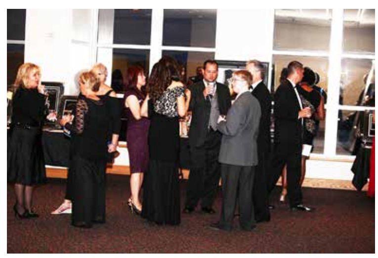
Guests arriving at Casino Night