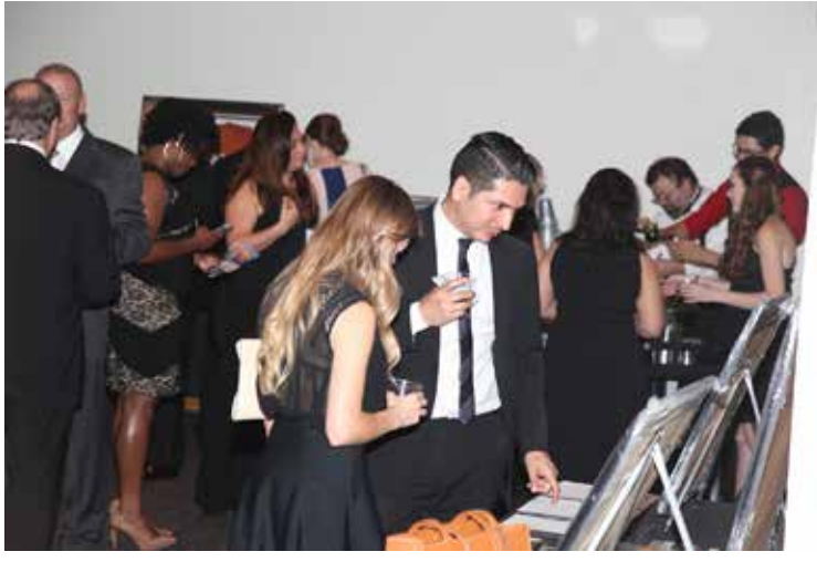
Guests checking silent auction