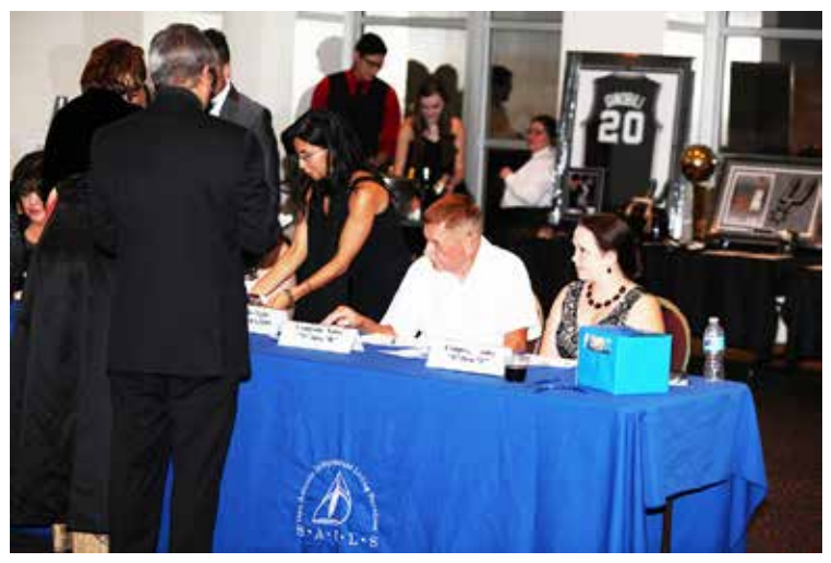
Casino guests register