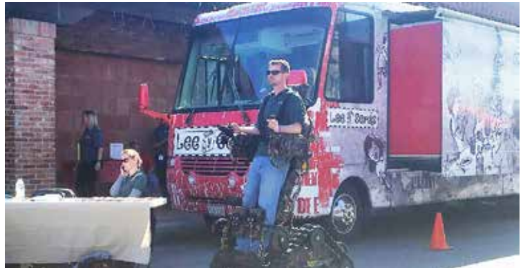
A mobility demonstration at Access Ability Fest

The exhibitor across from us was with Action Trackstander which featured an action trackchair that enables a person who uses a wheelchair to stand. It was really amazing to watch the demonstration. SAILS staff always have fun and look forward to attending and supporting this large accessible community-wide event.