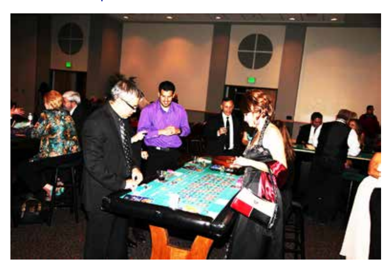
Guests at a game table