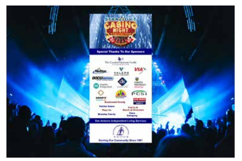
"Thank You" to all sponsors of the Starlight Casino Night