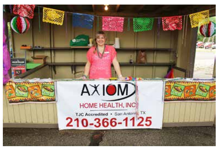
Axiom Home Health, Inc.