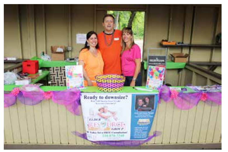
Elder Resource Group