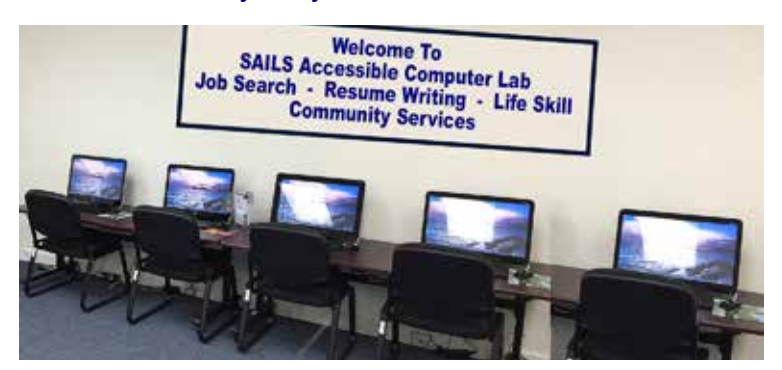
New accessible computer lab at SAILS

San Antonio Independent Living Services (SAILS) is pleased to announce the opening of a new updated and accessible computer lab. Consumers with all types of disabilities, veterans and Wounded Warriors will utilize the computers for job search, resume writing, applying for housing assistance and to locate many available community services.