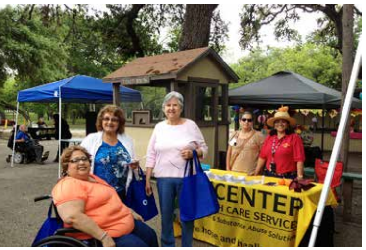
Guests at SAILS Fiesta Resource Fair