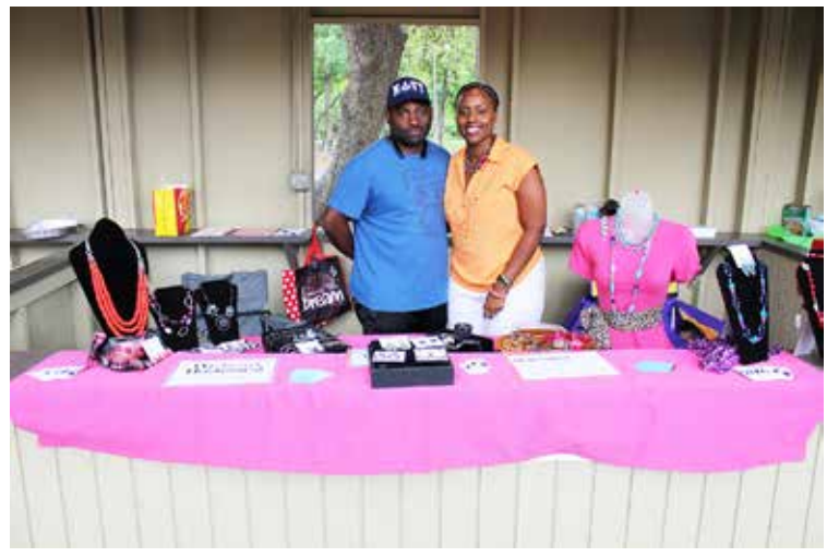
Premier Designs Jewelry Booth