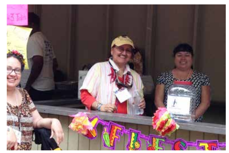
Volunteers at SAILS Fiesta Resource Fair