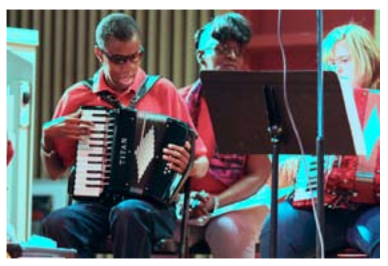
Members of Dreams Fulfilled Through Music perform at the ADA celebration event