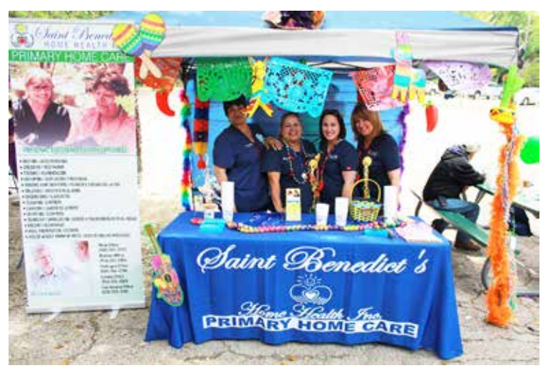
St Benedict's Primary Home Care