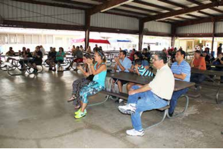
Guests Enjoying the Bands