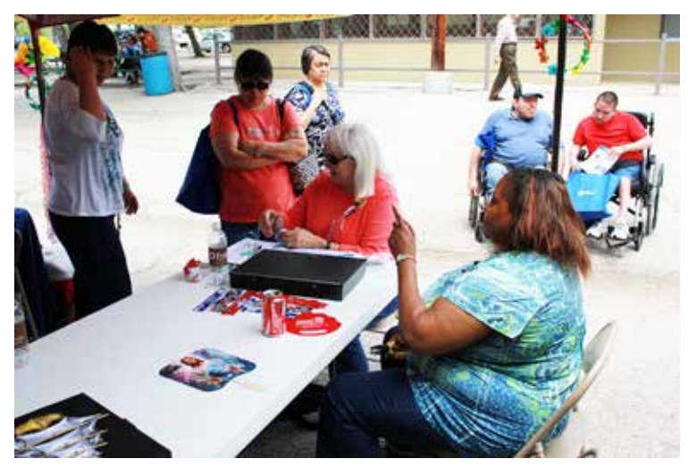
SAILS staff members meet and greet guests