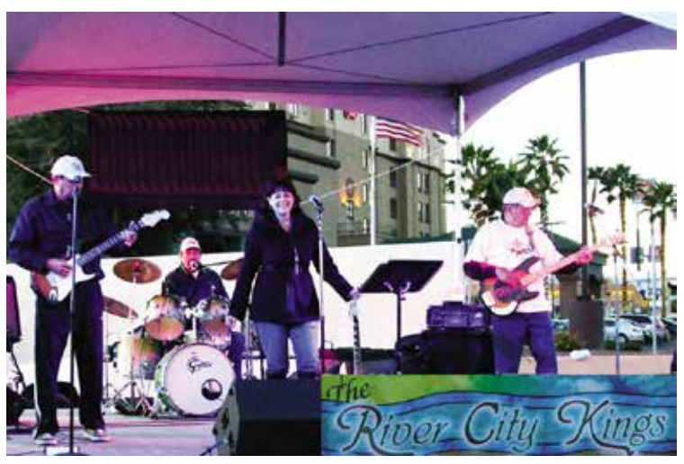
The River City Kings Band