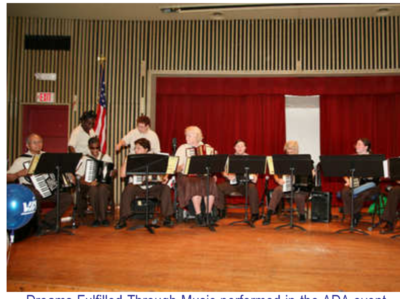
Dreams Fulfilled Through Music performed in the ADA event