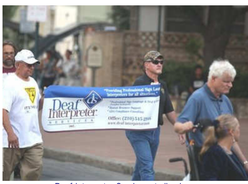
Deaf Interpreter Services strolls along