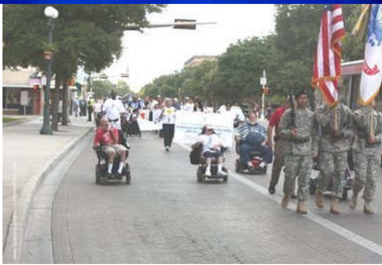
Honor Guards leads the ADA stroll!