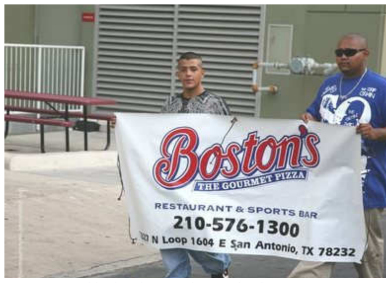
Youth volunteers by carrying banners