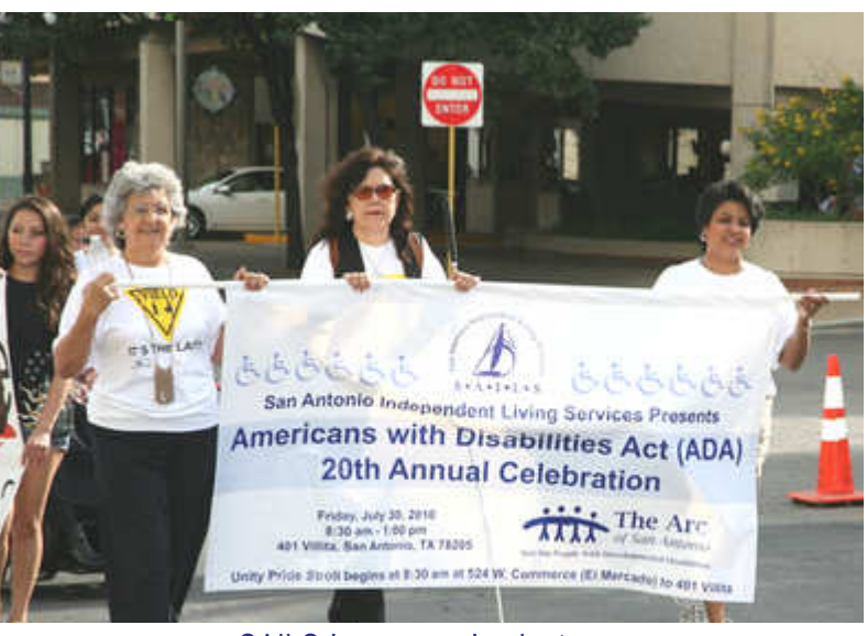
SAILS banner and volunteers