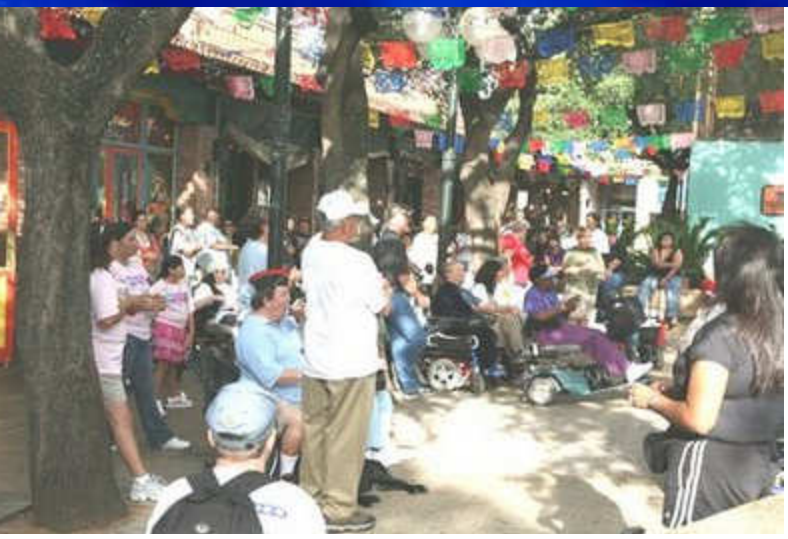
Attendees waiting to start the stroll