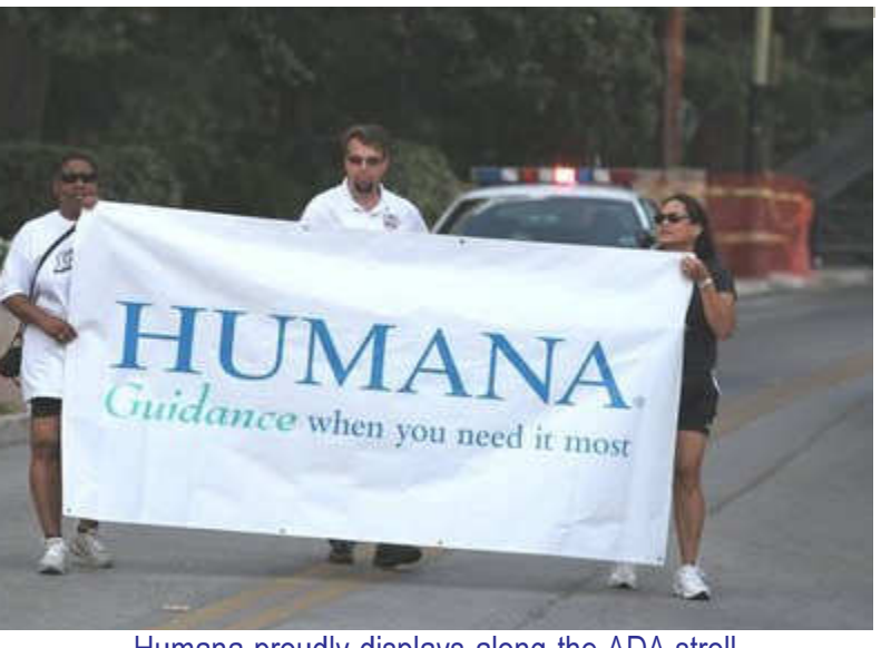
Humana proudly displays along the ADA stroll