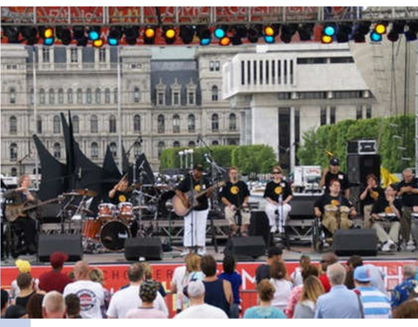
Flame The Band at one of their performances July 4th 2010 in D.C.