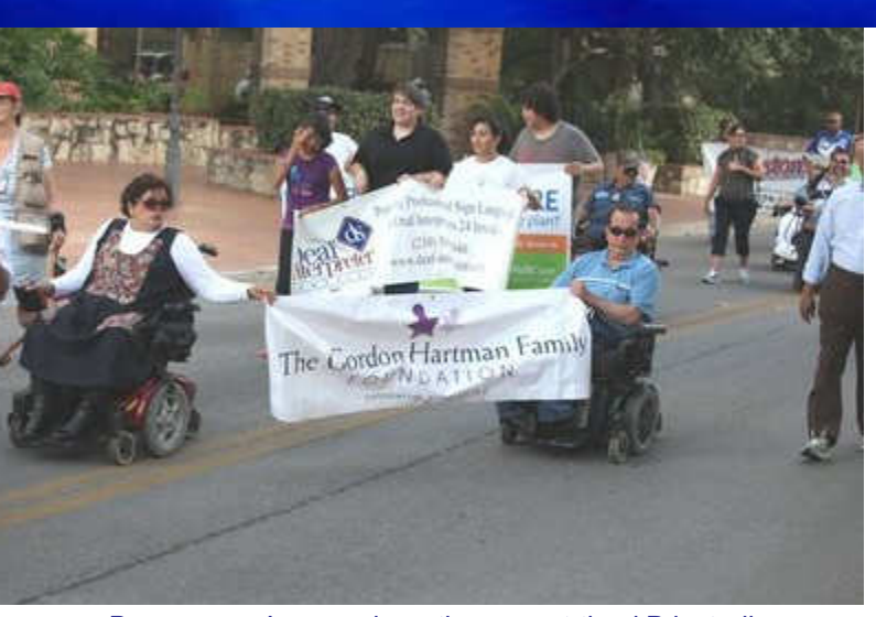
Banners and more along the way at the ADA stroll